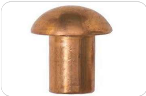
PRECISION COPPER REVER