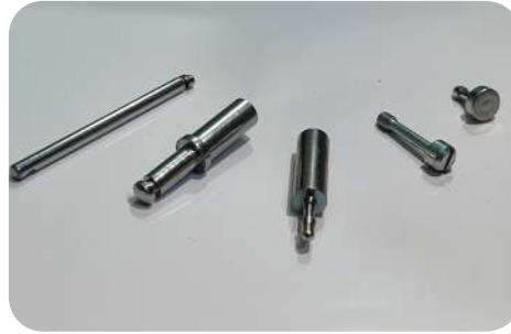
AUTOMOBILE PARTS 2