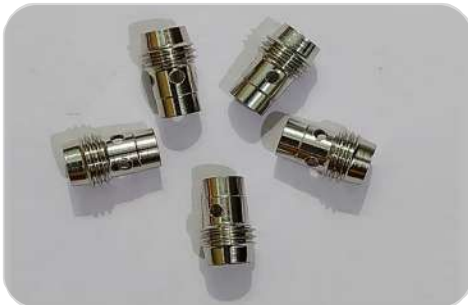
M-08 MALE CONNECTOR HOUSING