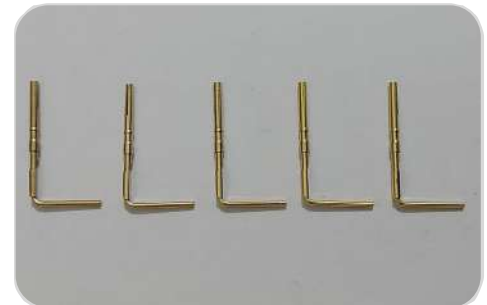
M-12 RECTANGLE FEMALE PIN