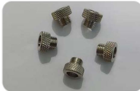
M-08 MALE KNURLING