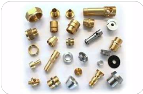
PRECISION TURNED PARTS