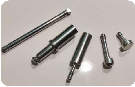
AUTOMOBILE PARTS 1