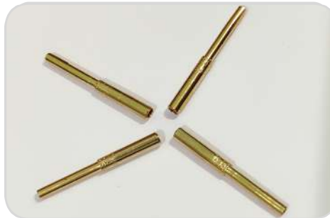
CONNECTOR FEMALE PIN