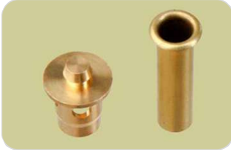
BRASS ELECTRONIC COMPONENTS