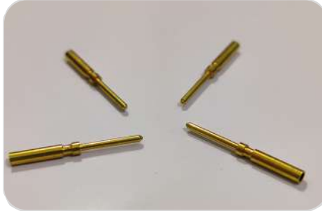
M-08 MALE PIN