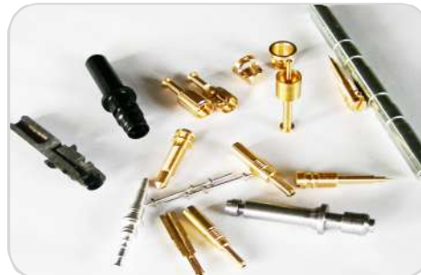
PRECISION TURNED PARTS