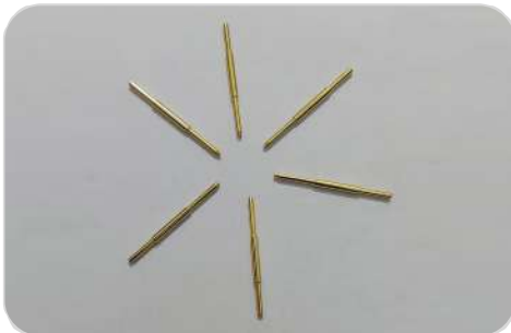
M-012 MALE PIN