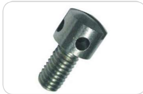
SLOTTED CAPSTAN SCREWS