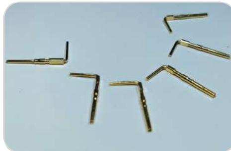
L TYPE MALE PINS