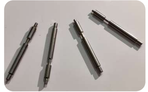
AUTOMOBILE PARTS 3