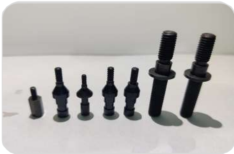
SPINDLE WITH BLACODIZING