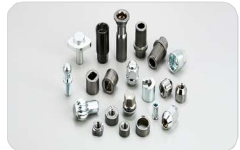
PRECISION TURNED PARTS