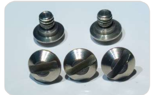
SS 316 SCREW